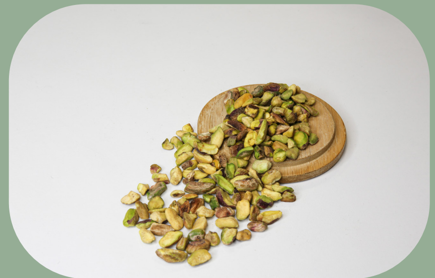
Half Split Kernel

kernels are the edible seeds found inside the shells of pistachio nuts. They have a beige or light green color and are known for their rich, slightly sweet flavor. These kernels can be enjoyed as a snack on their own, added to various dishes such as desserts, or used as a topping for salads. They are also a good source of protein, healthy fats, and various nutrients, making them a popular and nutritious choice for culinary applications. Additionally, they are often used in confectionery and baking due to their pleasant taste and vibrant color.